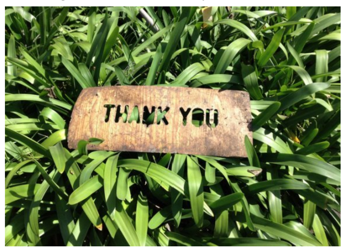
Finally, if you enjoyed this book, would you be kindly leave a review for this book on Amazon?

The next step is to take these lessons with you!